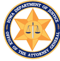
BRENNA BIRD ATTORNEY GENERAL STATE OF IOWA