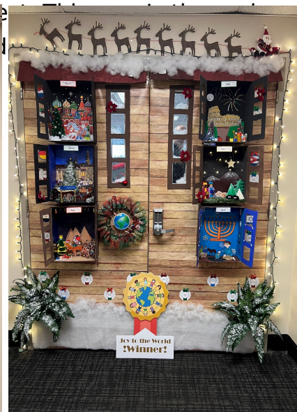
ved ision took