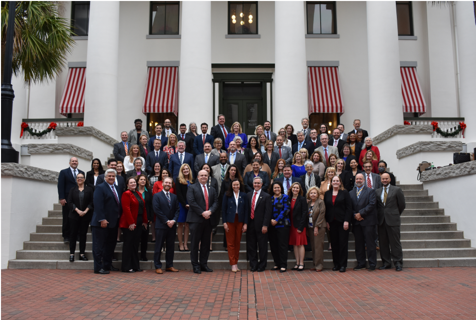
The Florida Attorney General's Office Tallahassee employees in the Collins Building