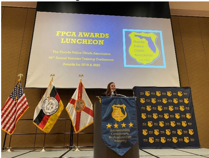
Attorney General Moody speaking at the Florida Police Chiefs Association's Annual Summer Training Conference.