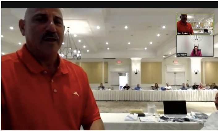
Attorney General Moody virtually addressing members of Florida TaxWatch during the organization's 41st Annual Meeting.