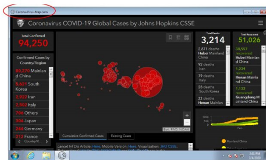
Figure 1. Screenshot of the malicious website "Corona-Virus-Map[dot]com" pretending to be a legitimate COVID-19 tracker.

This week, I issued a Consumer Alert to warn Floridians about scams related to the COVID-19 pandemic.