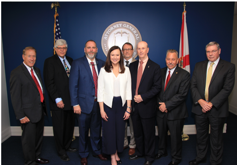
Attorney General Moody speaking to leaders of the Florida Tax Collectors Association in Tallahassee about her 2020 legislative priorities.