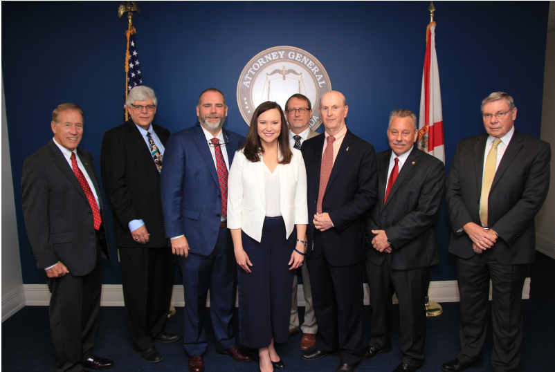
Attorney General Moody speaking to leaders of the Florida Tax Collectors Association in Tallahassee about her 2020 legislative priorities.