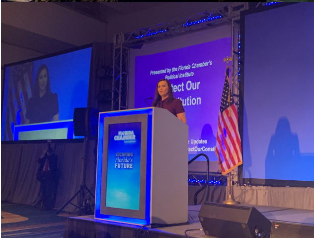
Attorney General Moody honoring the latest inductees at the Florida Women's Hall of Fame ceremony in Orlando.