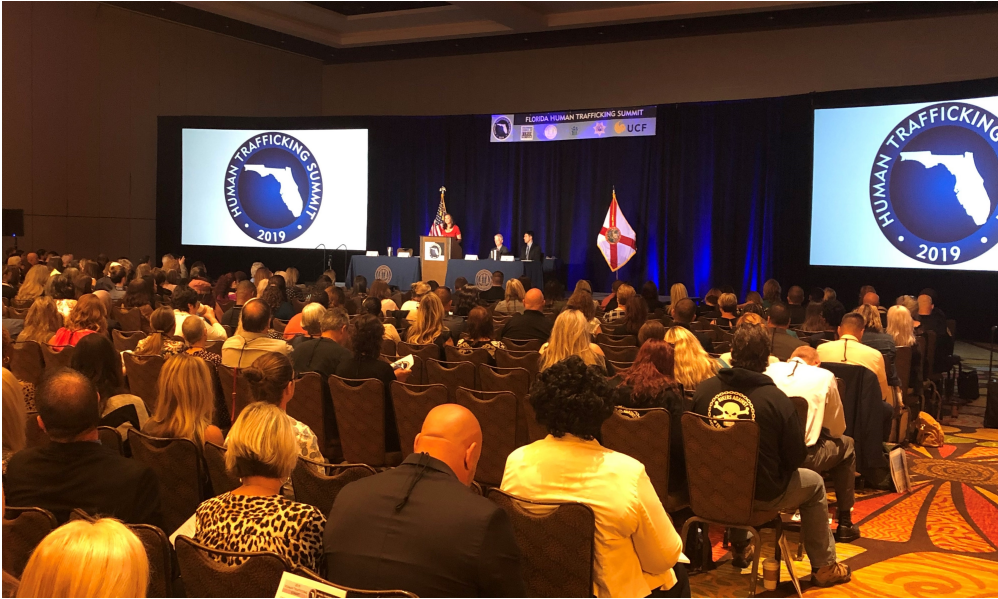
PHOTO RELEASE: Attorney General Hosts 2019 Human Trafficking Summit

Attorney General Ashley Moody kicked off the 2019 Annual Human Trafficking Summit in Orlando. Florida’s Human Trafficking Summit brings together local, state and national leaders working together to eradicate all forms of trafficking. Attendees participated in targeted breakout sessions covering legal/law enforcement, service delivery, policy and research, and medical/healthcare. Attorney General Moody gave opening remarks to more than 850 registered attendees, including welcoming Governor Ron DeSantis to the Summit.