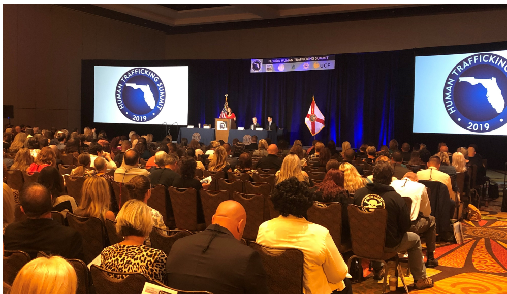
PHOTO RELEASE: Attorney General Hosts 2019 Human Trafficking Summit

Attorney General Ashley Moody kicked off the 2019 Annual Human Trafficking Summit in Orlando. Florida's Human Trafficking Summit brings together local, state and national leaders working together to eradicate all forms of trafficking. Attendees participated in targeted breakout sessions covering legal/law enforcement, service delivery, policy and research, and medical/healthcare. Attorney General Moody gave opening remarks to more than 850 registered attendees, including welcoming Governor Ron DeSantis to the Summit.