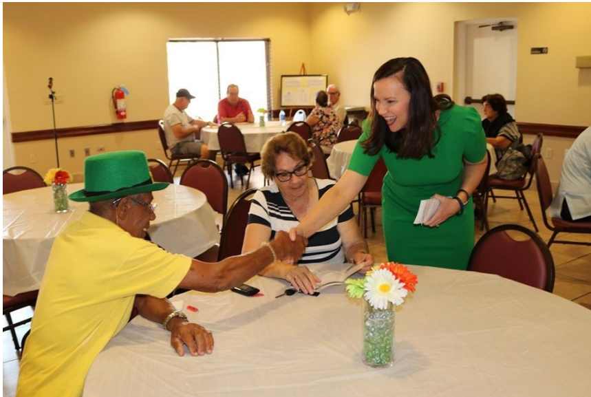
Attorney General Moody meeting with West Miami city and law enforcement officials.