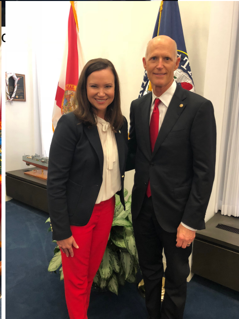
and Rick Scott on Capitol

Attorney General Moody delivering the keynote address at the Leon County Sheriff's Office First Responders Appreciation Luncheon in Tallahassee. Attorney General Moody thanks the brave men and women of law enforcement for the sacrifices they make every day to keep us safe.