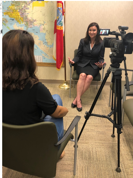
Mental Health and