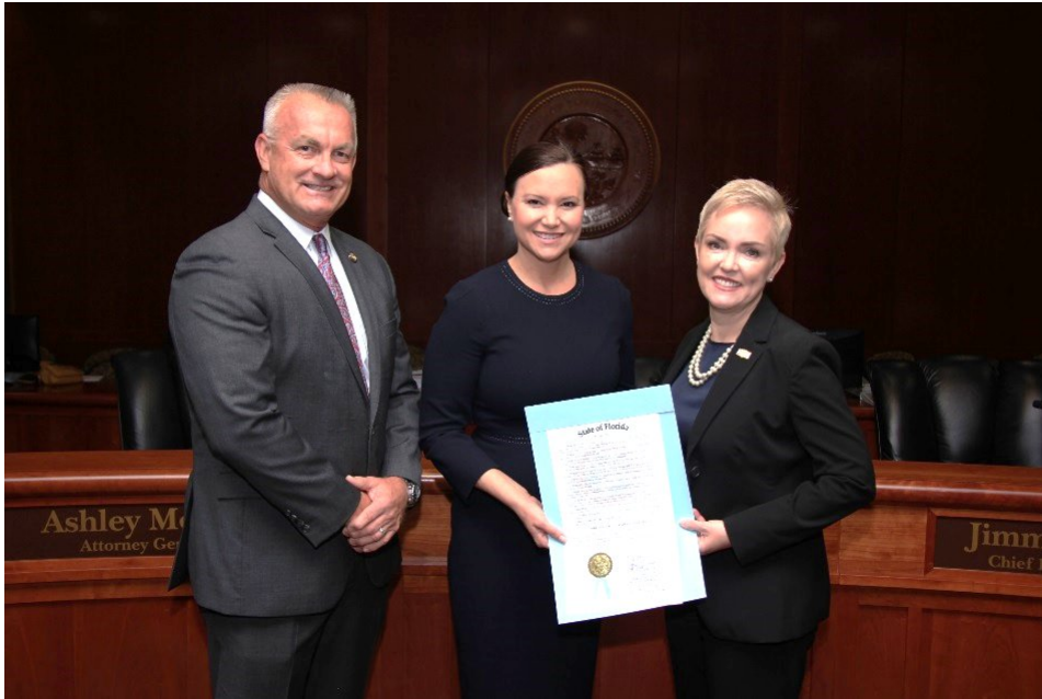
PHOTO RELEASE: Attorney General Moody Sponsors World Elder Abuse Awareness Day Resolution

Attorney General Ashley Moody presented a resolution to the Governor and Florida Cabinet recognizing World Elder Abuse Awareness Day. Proclaimed by the International Network for the Prevention of Elder Abuse in 2006, the day recognizes elder abuse as a public health and human rights issue. World Elder Abuse Awareness Day is commemorated every year on June 15 in the United States and around the world. The resolution passed unanimously.