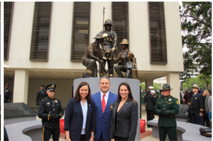
Attorney General Moody speaking at the Ringing of the Bell Ceremony commemorating fallen Florida firefighters. Attorney General Moody, Governor DeSantis and the Florida Cabinet honored the 197 fallen firefighters in Florida's history.