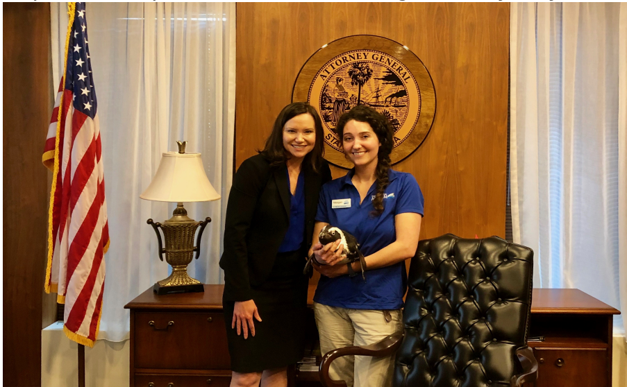
Capitol to help celebrate Hillsborough County Day.