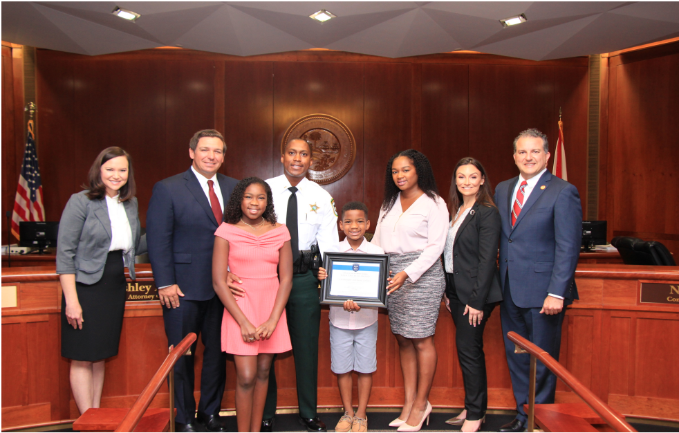
Attorney General Moody visiting with Florida sheriffs as part of Sheriffs Day at the Florida State Capitol.