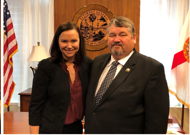
Attorney General Moody visiting the Attorney General's Tampa field office and