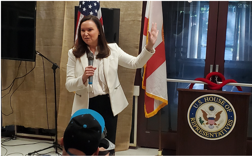
Attorney General Moody meeting with a Florida senior while at the senior fair.