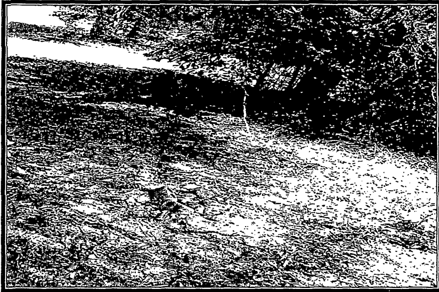
Photograph 5: View to north of bricks possibly from the Moore house.