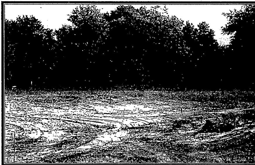
Photograph 2: Photograph from 2003 looking to the northeast of the refuse pit (flagged area) and the Moore house site (house site is delineated with a wooden fence).