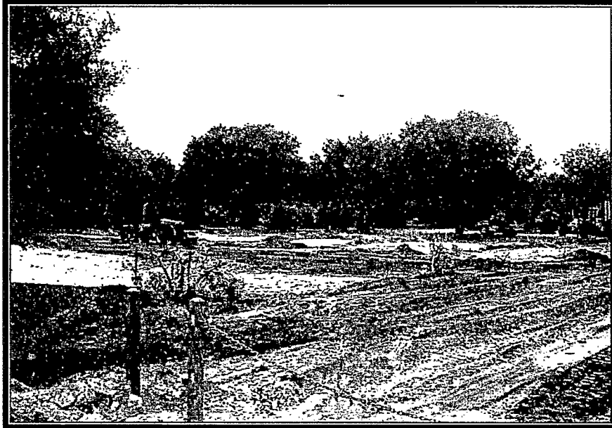
Photograph 1. Photograph from 2003 looking to the southwest toward Moore house site and refuse pit (Feature 4).